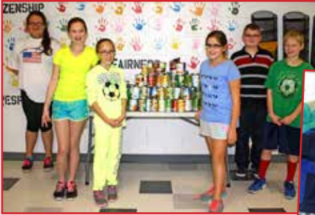
Members of Student Council with the results of the can drive

educated about the dangers and consequences of drugs and other unhealthy choices. Holley students received an apple at the end of their healthy walk around the Holley campus.